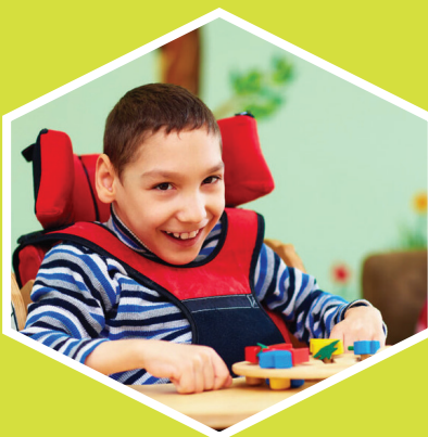
Children & Young People