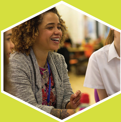
Support for Teaching & Learning