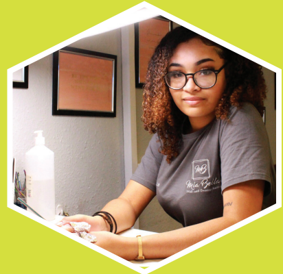
Nails & Beauty