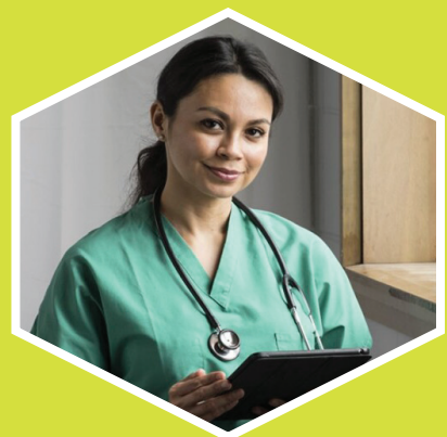
Clinical Healthcare Support