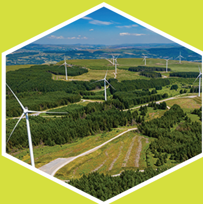
Energy & Carbon Management