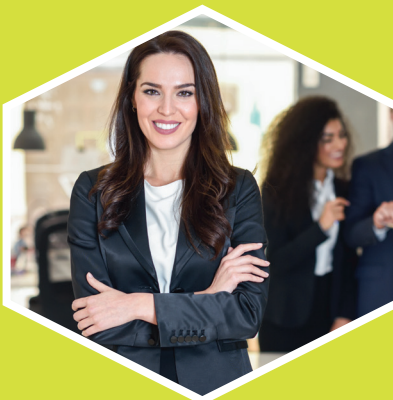
Leadership & Management