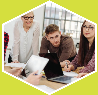
Leadership & management for Educators