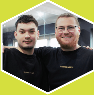
Jobs Growth Wales+