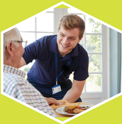
Health & Social Care