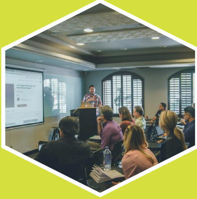
Digital Learning Practitioner