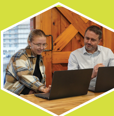
Digital Skills for Business