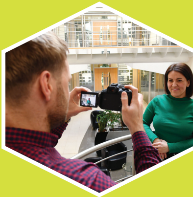
Social Media for Business