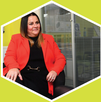
Advice & Guidance