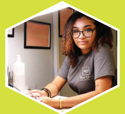
Nails & Beauty