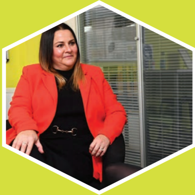
Advice & Guidance