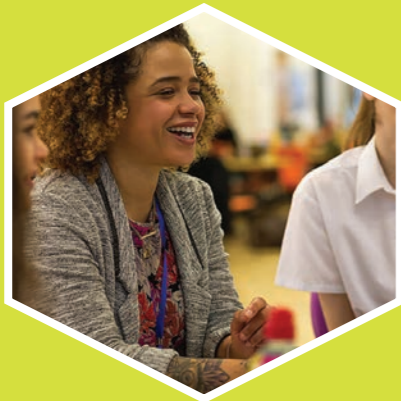
Support for Teaching & Learning