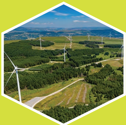
Energy & Carbon Management