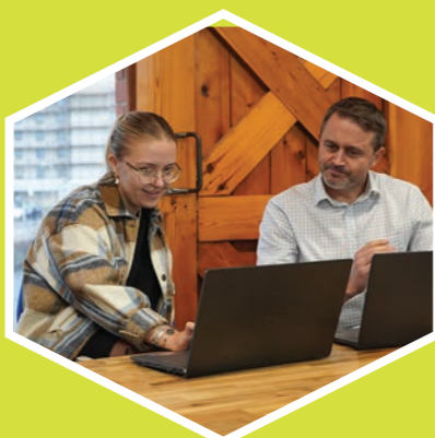
Digital Skills for Business