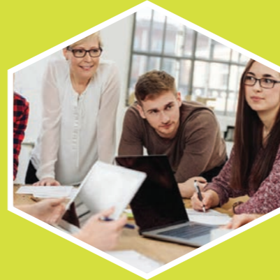
Leadership & management for Educators