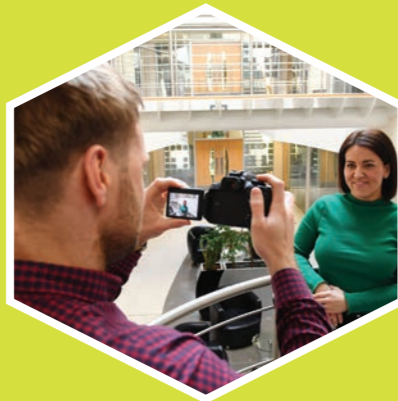
Social Media for Business