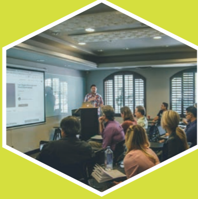
Digital Learning Practitioner