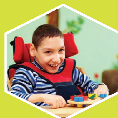
Children & Young People