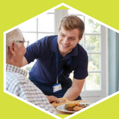
Health & Social Care