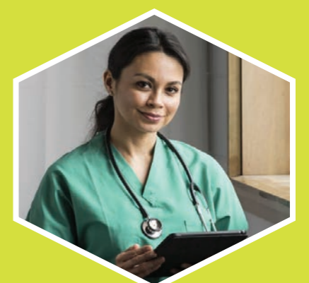
Clinical Healthcare Support