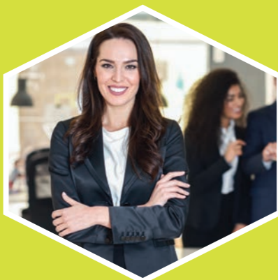
Leadership & Management